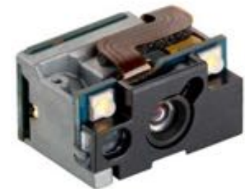
TC8000-1 Standard Range Imager