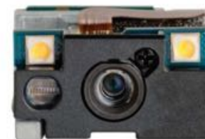
TC8000-2 Medium Range Imager