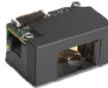
TC8000-A 1D Standard Range Laser