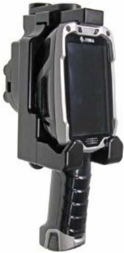
MNT-TC8X-FLCH-01 Forklift Holder for TC8000