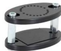
3PTY-PCLIP-215677 Forklift Clamp Mount