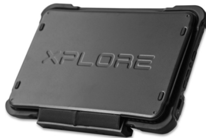
Keyboard in closed position via magnets, protecting display glass