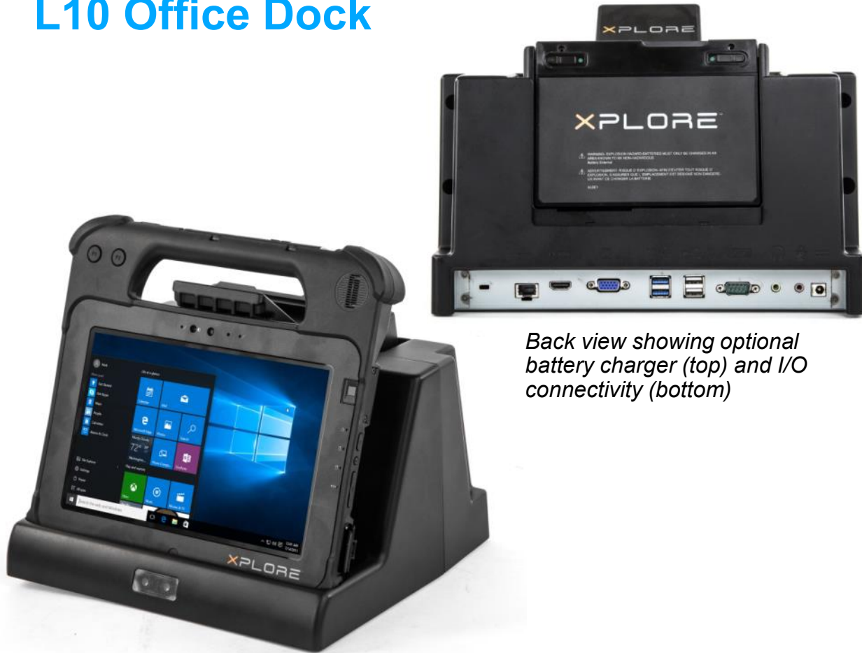
Back view showing optional battery charger (top) and I/O connectivity (bottom)