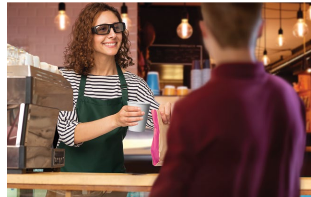
Enhancing service in retail through mobile hands-free access

The Vuzix Blade Smart Glasses are completely untethered, and support both Wi-Fi and Bluetooth interfaces to phones and the Internet. They deliver a hands free connection of the